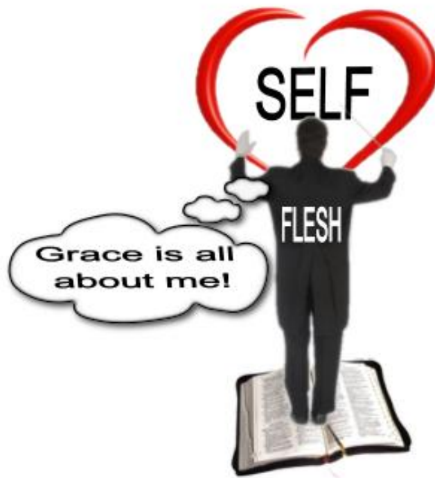
The flesh set the conditions for grace to function for self.

As a result we now have a situation where Christians speak the language of the flesh rather than the language of the covenant. "And their children spake half in the