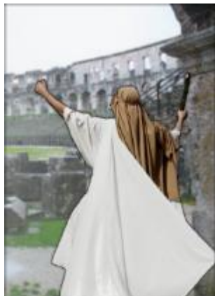
Apostles teach doctrine

We need to be instructed in a new language that will enable us know what God's alphabet means to express Christ. Apostles are called "fathers" of the faith because they instruct the church in the language of the covenant.