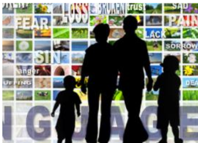
The language of our first birth is being expressed.

Can you see the birthright of your first birth and how Jesus was pointing that out for you? We learned a tradition of lack, sorrow, sin, and broken trust from our first birth ----- and learned to express that experience through language.