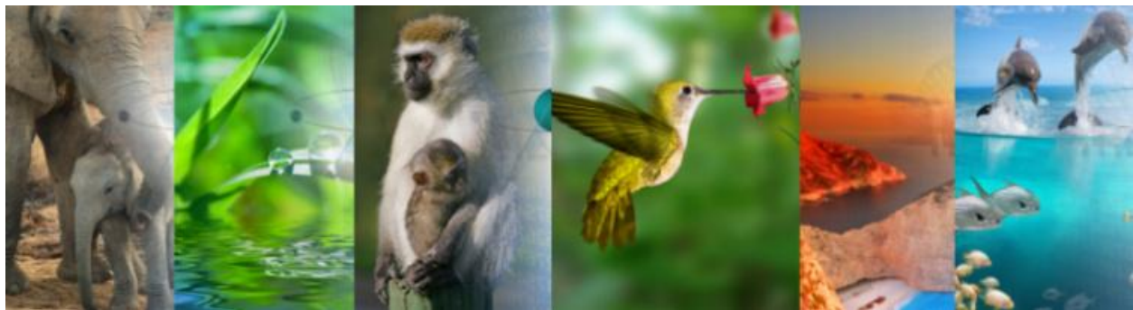
The fingerprint of the God-Code in all creation.

Of course, this passage of scripture is referring to Jesus Christ. God identifies Jesus as the “WORD of God” to teach us that He speaks to humanity by all things He created.