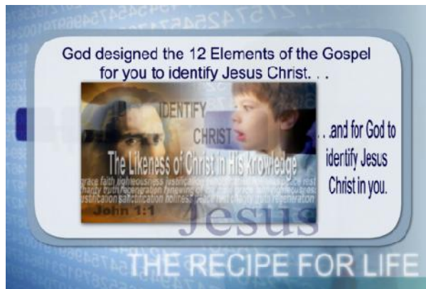
How can you identify Jesus Christ?

God designed the 12 Elements of the Gospel [12 Foundation Stones ] for you to identify Jesus Christ and for God to identify Jesus Christ in you.